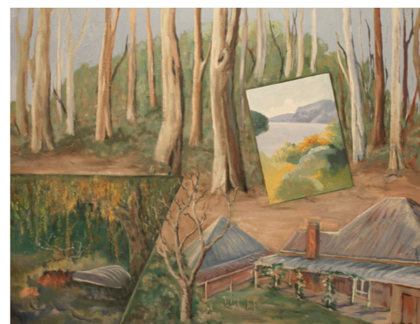
Riversdale , 2014, oil on canvas