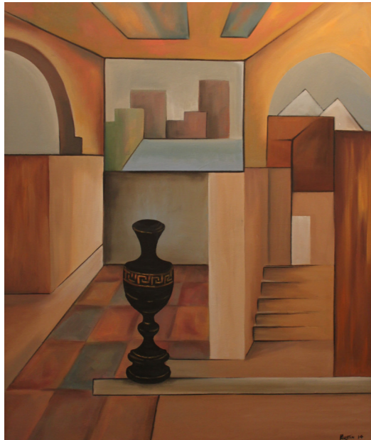
New directions II, 2014, oil on canvas