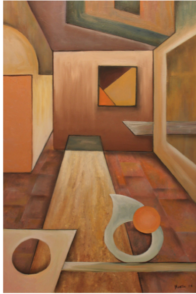
New directions I, 2014, oil on canvas