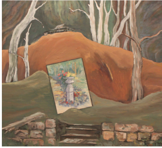
The home that was, 2014, oil on canvas