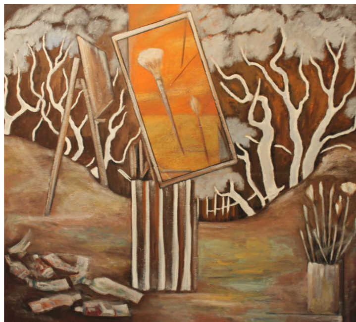
The impossible dream , 2010, oil on canvas