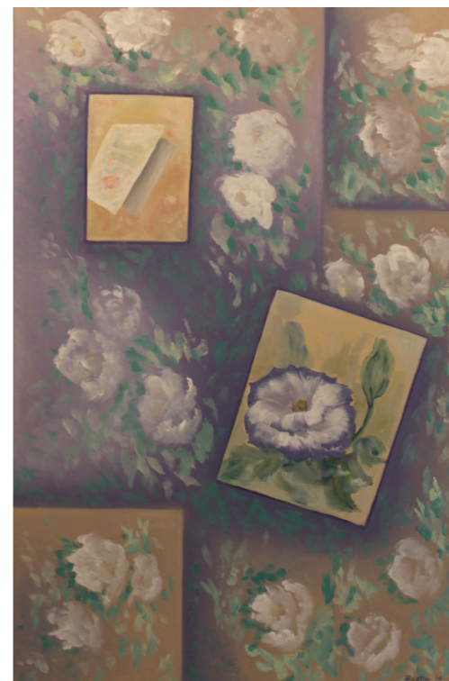
A special occasion , 2014, oil on canvas