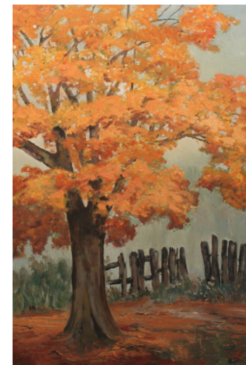
The rabbit , 2014, oil on canvas