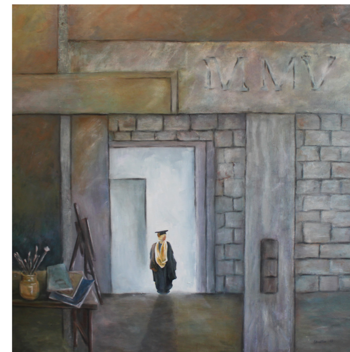
The graduate , 2013, oil on canvas