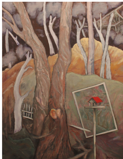
Where are the birds, 2014, oil on canvas