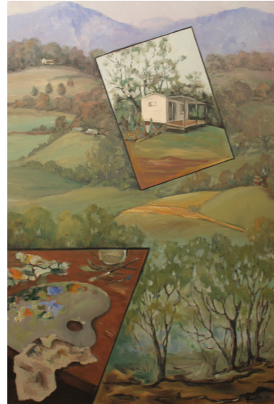
Pinecone studio, 2014, oil on canvas