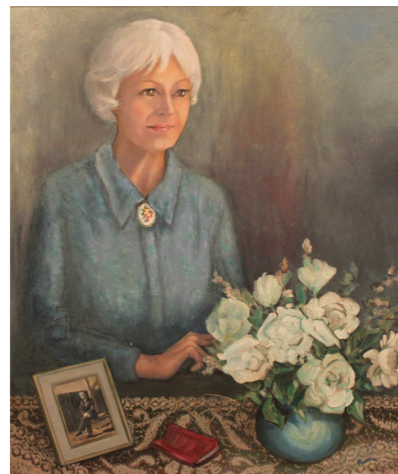
Remembering my father , 1980, oil on canvas