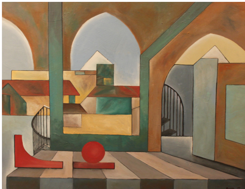
New directions III, 2014, oil on canvas