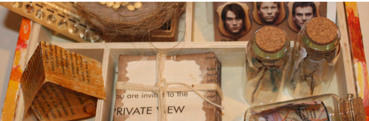
Image: Vikki Kindermann, Sentiments of Self (detail), 2015, mixed media and found objects box assemblage, 25 x 25 x 25cm

My assemblage and mixed media art works are a lighthearted attempt to play with the labels often given to women of particular ages. I am aiming to explore some of the stereotypes, clichés, puns and jokes we perpetuate about marriage and relationships. Alternatively, I wanted to make reference to some private and personal memories, sensations, dreams, and wishes. - Vikki Kindermann