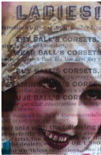
Images: Michael Nieddu, Untitled , 2015, mixed medium palimpsest, 21 x 29cm