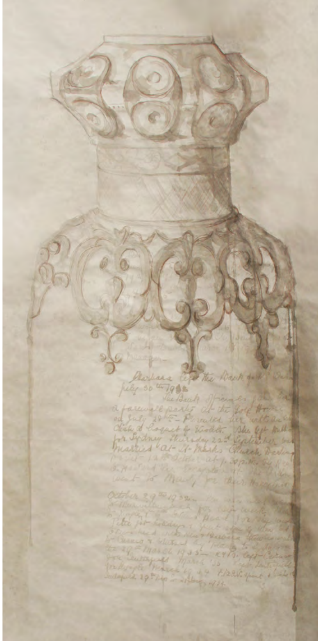
Image: Judy Constable, Monument I , 2015, watercolour and watercolour pencil on Awagami Kozo paper, 96 X 200cm

Over time, her glory box, and its contents not only became indelibly linked to her identity, but the significance of the box, and the individual items it contained have magnified in importance. The objects within, increasingly rare, and protected over decades in the cedar scented box bear the marks of previous owners, but now seem dated, fragile, and curiously unfamiliar. A perfume bottle, brush, fan, diary. Monuments to previous generations held in a glory box. - Judy Constable