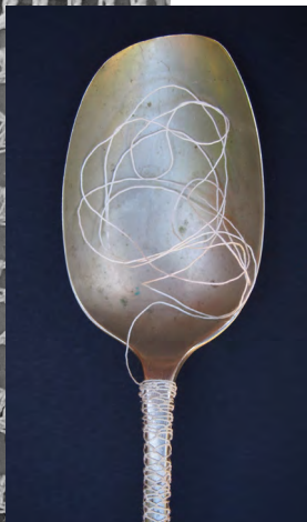
Image top: Chrys Zantis, Finery and drudgery (detail), 2015, wooden box, vintage spoon and crochet cotton, 75 x 400cm Image bottom: Chrys Zantis, Behind the blind , 2015, wooden box, family cookbook and crochet cotton, 75 x 400cm

I have used these dowry crafts to encase the memory already embedded in the objects with new meaning. In the case of the worn spoon I revere the repetitive meditative probably arduous action of stirring by embellishing it with fine needlework. By crocheting around the stamps I capture the action of ripping them from the envelope and protecting their memory and importance to someone so far from family and homeland. The cookbook held promise in the anticipation of recreating delicious meals from home like her mother’s but it also witnessed how those dreams become mediocre and repetitive. The repaired hook speaks of a time when a poor young woman made dowry items for the wealthy and had none of her own. When her crochet hook broke she repaired it because she could not afford a new one. I broke my hook and repaired it in the same fashion and made pieces to connect with her. - Chrys Zantis