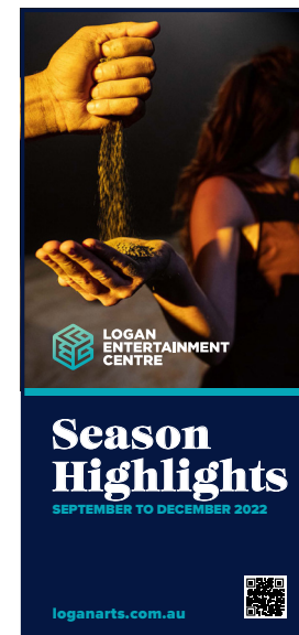
Season program - folded A3