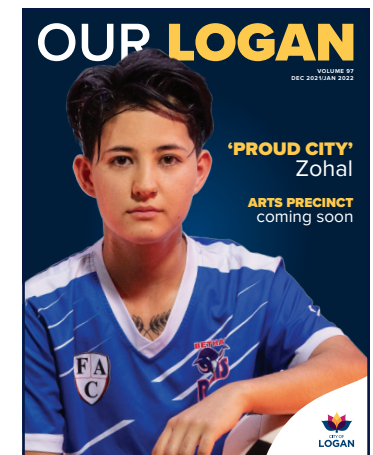
Our Logan magazine