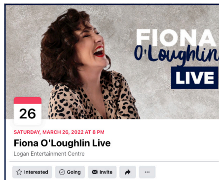
Facebook event banner