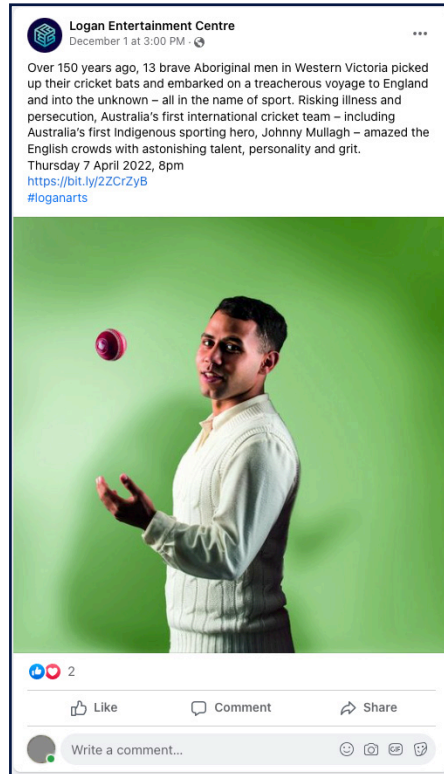
Facebook post example