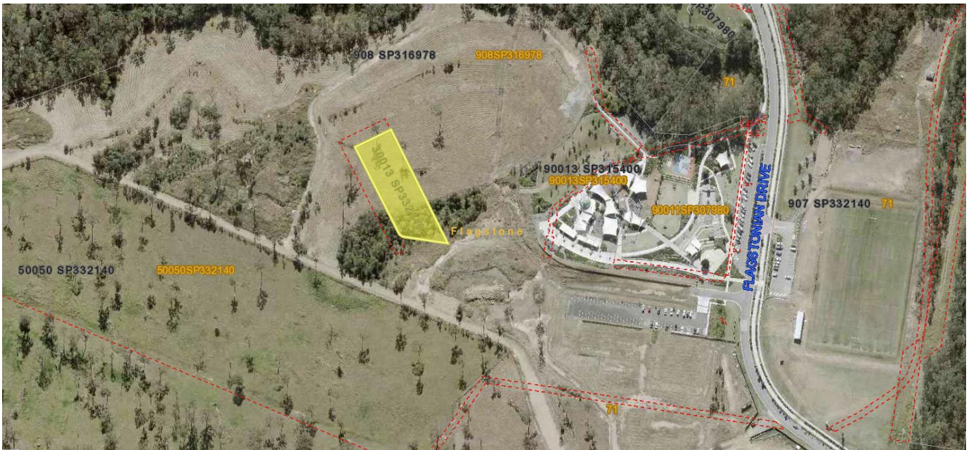
Figure 1: Location of the proposed Flagstone DCC.

Logan City Council is seeking submissions from First Nations artists who are interested in developing First Nations designs relevant to the Flagstone area. These designs will be incorporated into the facade of the Flagstone Community Centre to be located on Lot 30013 Parklands Drive, Flagstone (refer Figure 1 ).