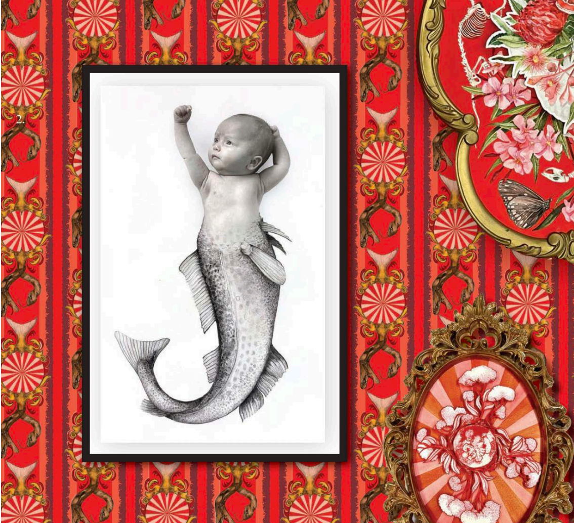
Nicola Hooper, Merbaby , 2023. 90cm x 70cm, hand-coloured lithograph printed over photograph. Mirror, Mirror , 2023. 75cm x 57m, watercolour and gouache painting. Yarrow and Tumour 2023. 20cm x 35cm, hand-coloured paper cut lithographs. Fishy Pythons Parade Wallpaper 2023, digital print of of watercolour and gouache drawing.