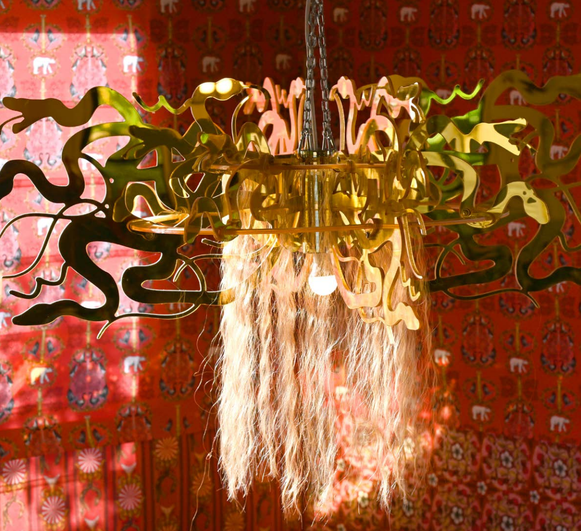
Nicola Hooper, Python and Piggy Tails Chandelier , 2025. 95cm x 55cm, mirror acrylic, hair, chain, LED light, suspended from ceiling-