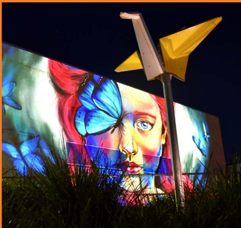
Stacey Bennett, The Butterfly Effect , 2023, pastels.