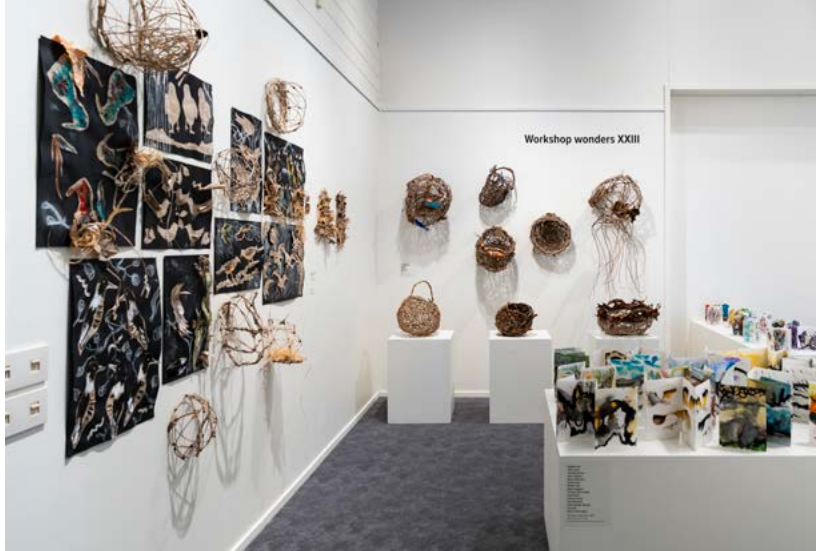
Workshop wonders XXIII installation, 2025