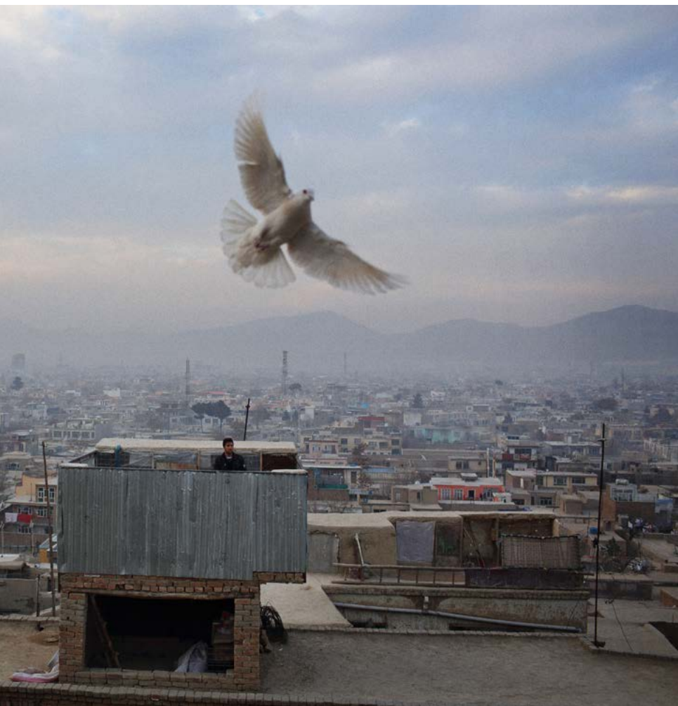
Image: Andrew Quilty, Qala-e Musa, Kabul City, Kabul Province , 29/1/2014, inkjet pigment print on Alupanel 33 x 49.5 cm. Courtesy of Andrew Quilty