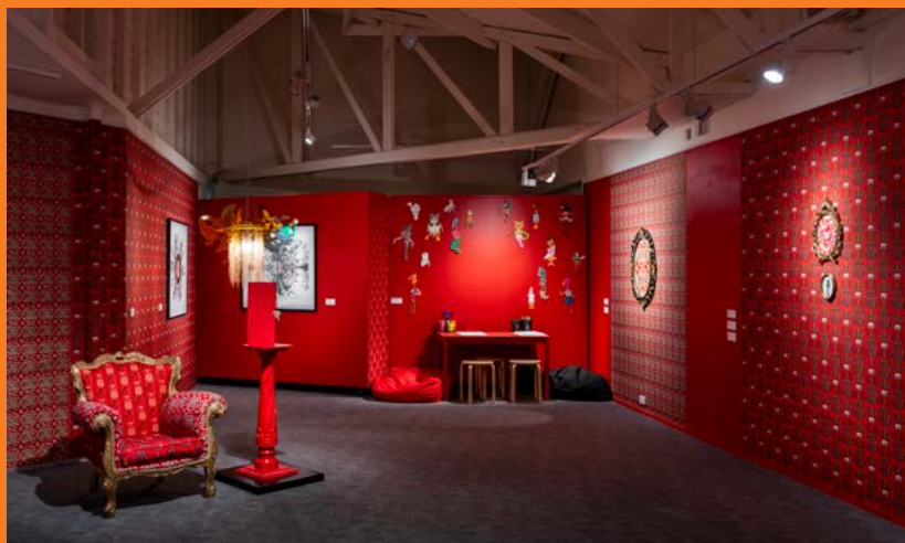
Nicola Hooper, A bestiary of reverie , 2025