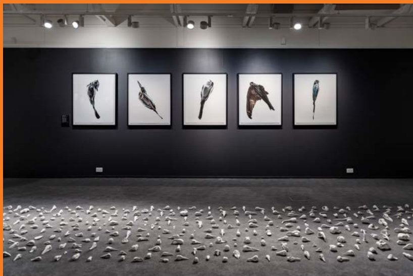
Christina Lowry, Ex Libris (from the library of) , 2025, installation image by Louis Lim