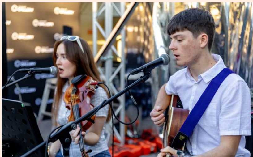
Performance by Edgy and Hedgy.