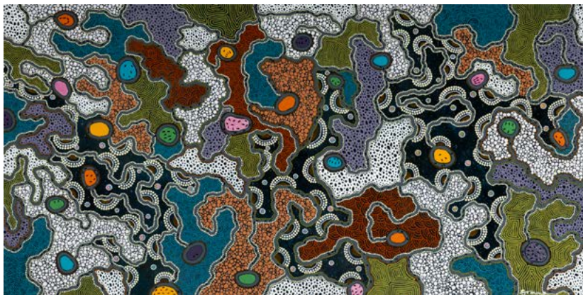
Sally Terare, Underground galaxy , 2019, acrylic on canvas. Logan Art Collection, purchased 2019